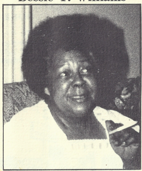
TUESDAY, OCTOBER 22, 1985—10:30 A.M. SOUTH LOS ANGELES MORTUARY CHAPEL 1020 W. 94th St., Los Angeles, Calif.